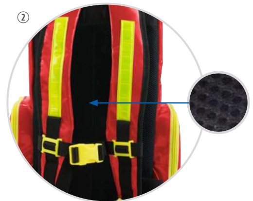
Net in back area